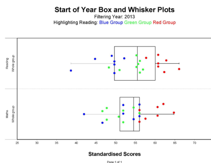
Box and whisker plot highlighting Reading Groups.

Your schools IDEAS+ file is stored at AusPIPS and can be downloaded for free whenever it is needed.